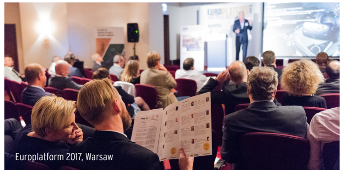
Europlatform 2017, Warsaw

The international event for the powered access industry celebrating best practice, excellence and innovation. For more information or to book go to www.ipaf-summit.info