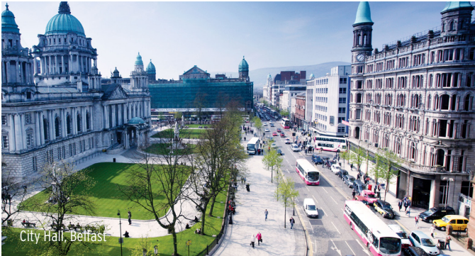
City Hall, Belfast

Belfast is packed with fascinating tours and attractions, luxurious shopping experiences, amazing eateries and great nightlife. As a Europlatform delegate you have access to a range of exclusive city offers through Visit Belfast. Show your Europlatform confirmation email (you can do this on your phone) or your delegate badge at any participating venue. For a list of offers visit: bit.ly/Belfast18